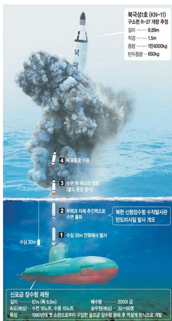
Figure 3. SLBM(Polar Star 1) test launched by North Korea.

The interviewees who provided the results of this study are an expert group of South Korea, consisted of 20 active military officers (5 from the Army, 5 Navy, 5 Air Force, and 5 from the Marine Corps), and the analytical results are summarized from April 2018.