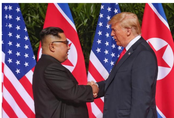
Figure 1. 2018 North Korea-United States summit.

For the past six months, however, the United States began a trade war with China, an economic supporter of North Korea, and firmly contained China, and confirmed the popular support for the Trump administration in the mid-term