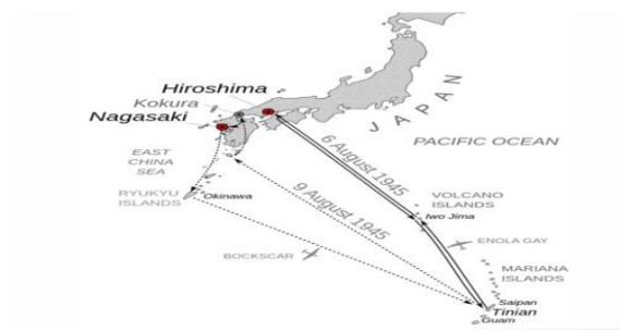
Figure 1. The US's use of nuclear weapons.

The following <Figure 1> is the US operation schedule of August 13, 1945.